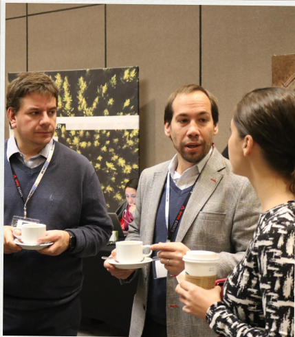
Mining & Critical Minerals Latin America Conference & Exhibition (10 - 11 December 2025) São Paulo, Brazil