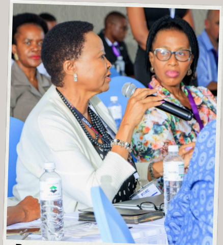
Botswana Mining & Energy (BME) Conference & Expo (16 - 17 March 2026) Gaborone, Botswana