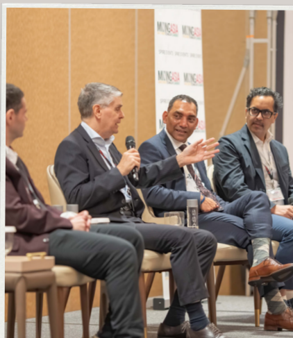
Mining Asia Conference & Expo (23 - 24 June 2026) Singapore