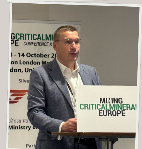
Mining & Critical Minerals Europe Conference & Exhibition (20 - 21 Oct 2026) London, United Kingdom