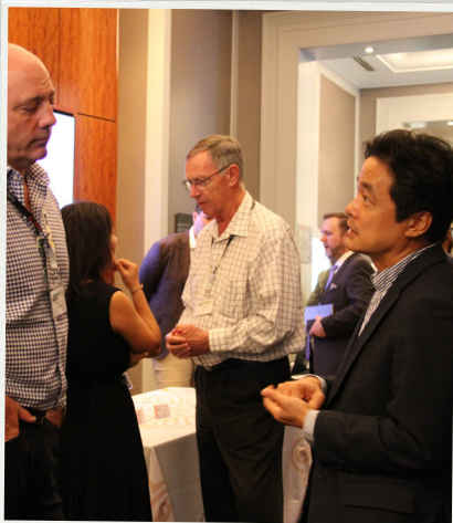
Mining & Critical Minerals Korea Conference & Exhibition (26 - 27 March 2026) Seoul, South Korea