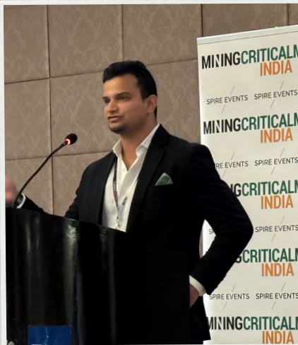
Mining & Critical Minerals India Conference & Expo (10 - 11 February 2026) Mumbai, India