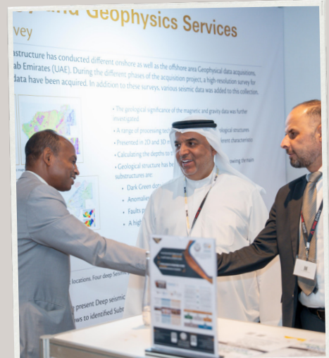
Mining & Critical Minerals Middle East Conference & Expo (13 - 14 April 2026) Dubai, United Arab Emirates

Scan here for our full 2025-2026 events calendar