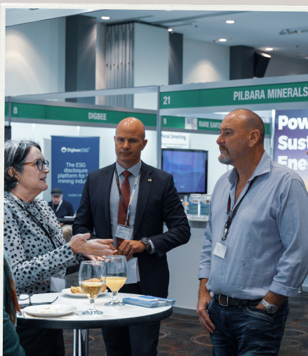
Critical Minerals Australia Conference & Exhibition (20-21 May 2026) Perth, Australia